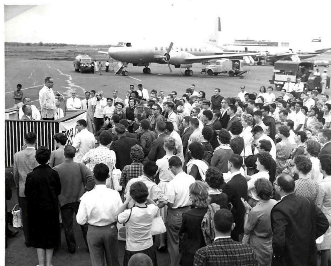
Photo: Arrival of the first PCVs to the Philippines, greeted by the Country Director.

Peace Corps/Philippines figures in another significant way in early Peace Corps history. The Towering Task is the pivotal founding document of Peace Corps. Written as a concept paper to shape the scope and timing of the new effort, The Towering Task argued against a slow and steady approach to start-up, which many were considering. Rather, it argued that a small program could fail as easily as a big one and a small program would make little difference in the world. To illustrate his points, the writer used the Philippines, proposing a program of 5,000 English teachers. Although the illustration was modified considerably in practice, it played a significant part in convincing Director Sargent Shriver and the other agency founders to launch the Peace Corps on a bold scale.