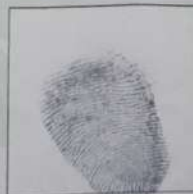
RIGHT THUMB MARK

Com. Tax No. : 29655175 Issued on : JUNE18, 2024 Issued at : MALINTA, VALENZUELA Date prepared : JUNE18, 2024 Valid Until : DECEMBER 2024