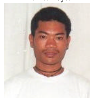
Loey Quilan Forestry State Polytechnic College of Palawan Home: Palawan