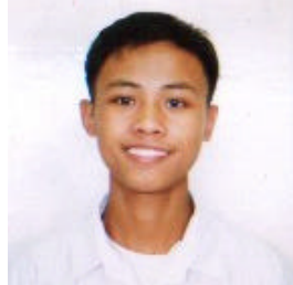
Ariestelo Asilo Biology UP Los Baños Home: Batangas